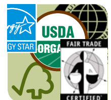
Your guide to consumer labels 6